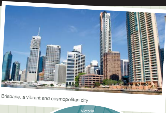
Brisbane, a vibrant and cosmopolitan city