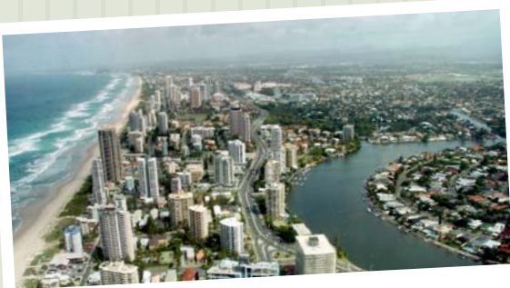
fantastic white-sand beaches on your doorstep

Study at our modern Surfers Paradise Study Centre on Queensland's fun-filled Gold Coast, and you'll be steps away from one of Australia's best beaches.