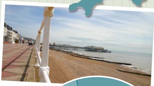
stroll along the seafront