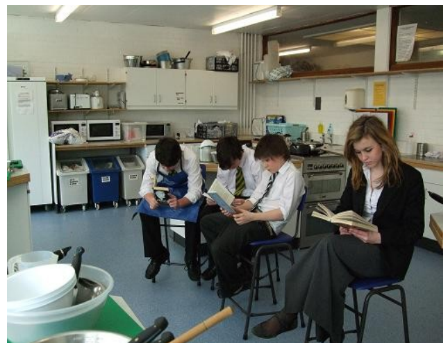
STOPPING TO READ