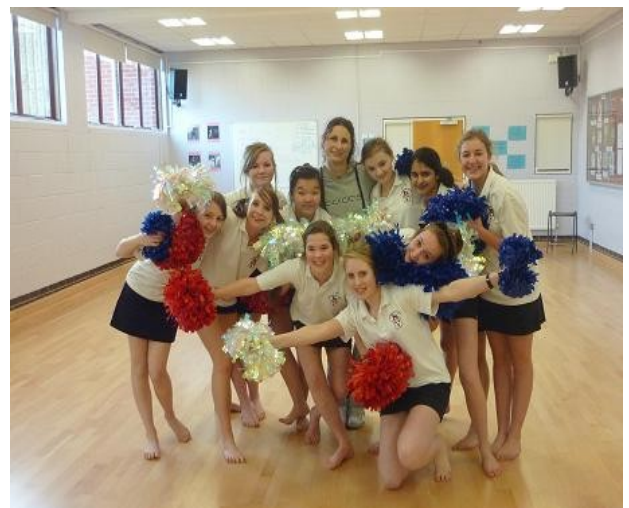
CHEER LEADING WORKSHOP