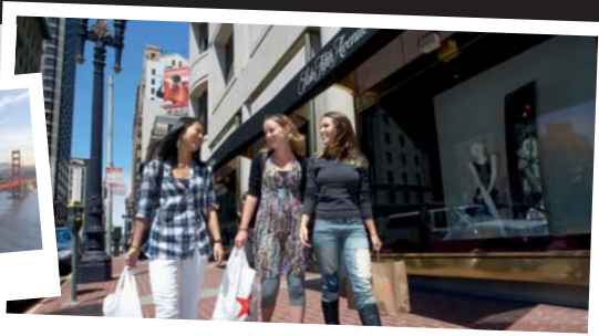
Go shopping with friends in the city centre