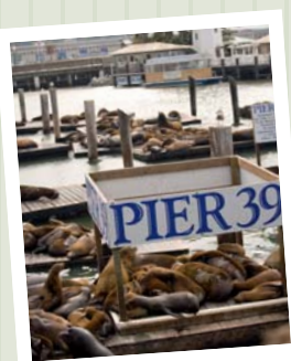
see the seals at Pier 39