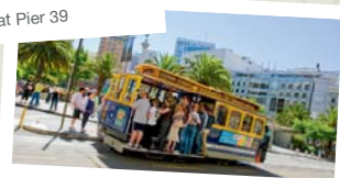
the world famous streetcar line