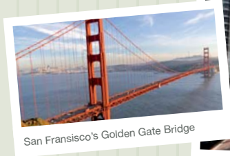
San Francisco's Golden Gate Bridge