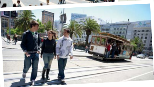
explore the city using convenient public transport

studying at Embassy San Francisco has been the greatest time of my life! The staff, the teachers, the classrooms, the technology... everything is perfect! I've learned a lot and not just English - I've also met wonderful friends from different cultures that have made my travels amazing. San Francisco - I love you!